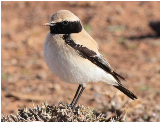
Desert Wheatear (male)