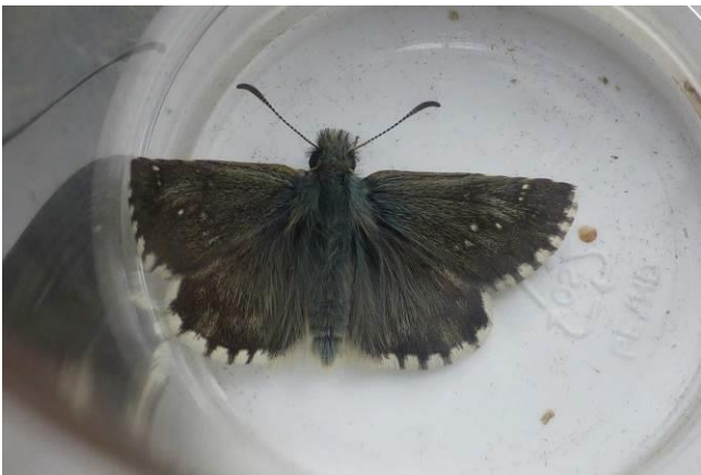
Dusky Grizzled Skipper - P. Harnes