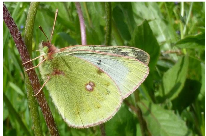
Mountain Clouded yellow - P. Harnes