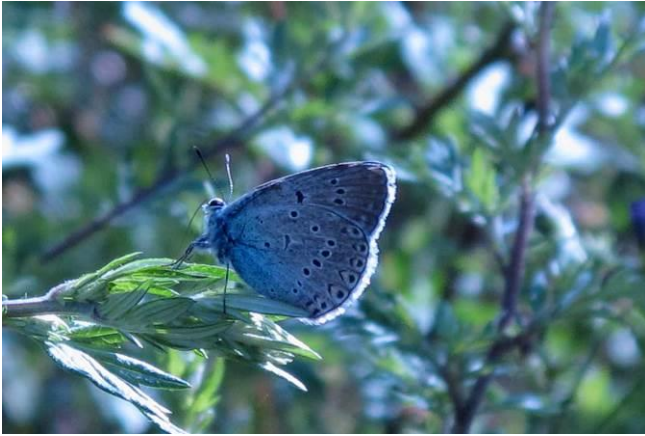
Amanda's Blue - P. Harnes