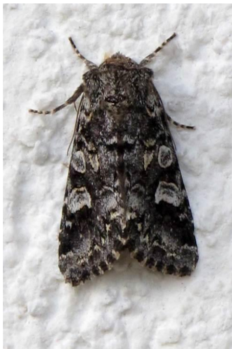
Glaucous Shears - Ian Tulloch