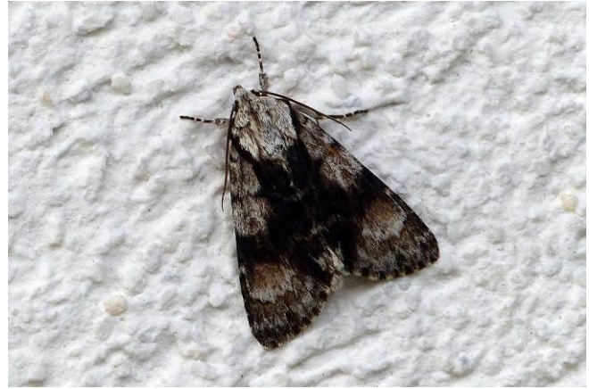
Alder Moth - I. Tulloch