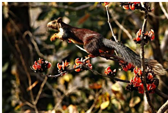
Malabar Giant Squirrel