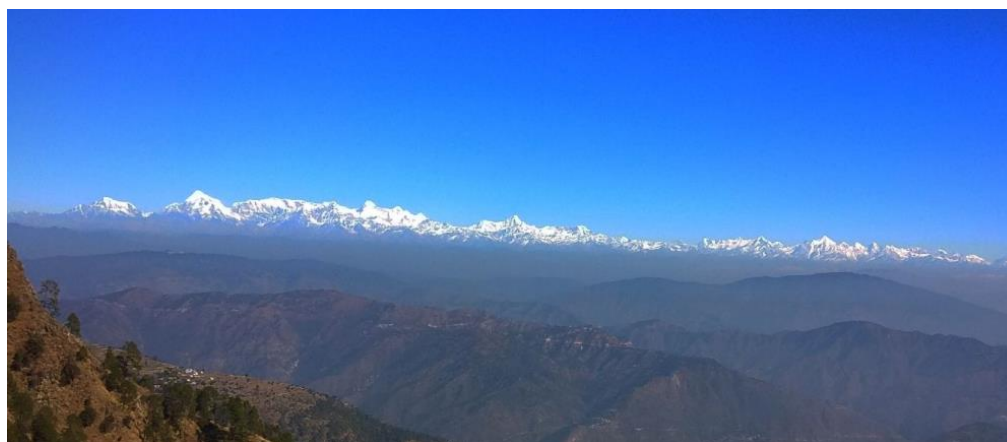
View of the Himalayan peaks from Nainital