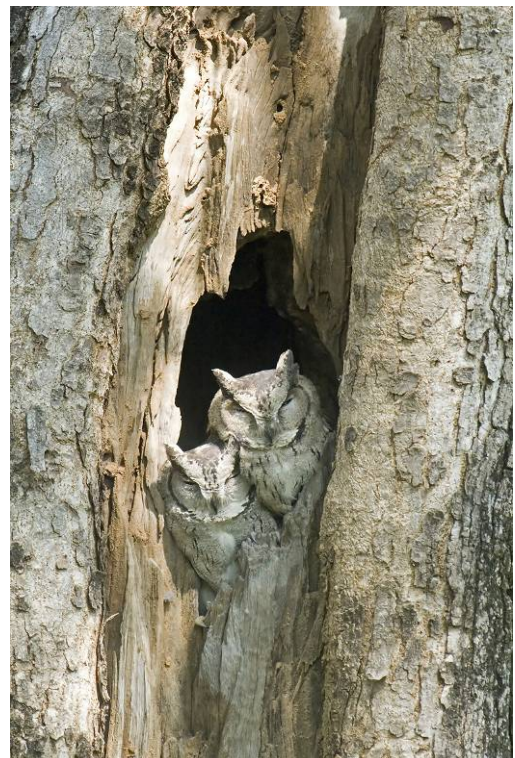
Indian Scops Owls