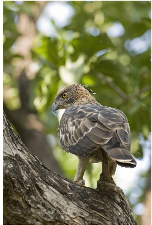
Changeable Hawk Eagle