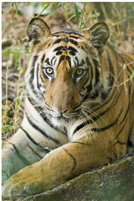
L1 from elephant back on Sunday 11 November