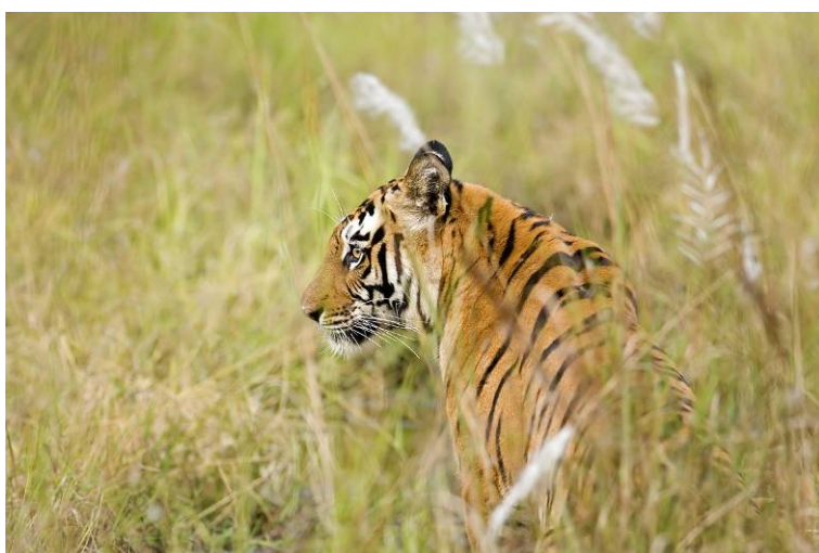
P12 from jeep on Tuesday 13 November