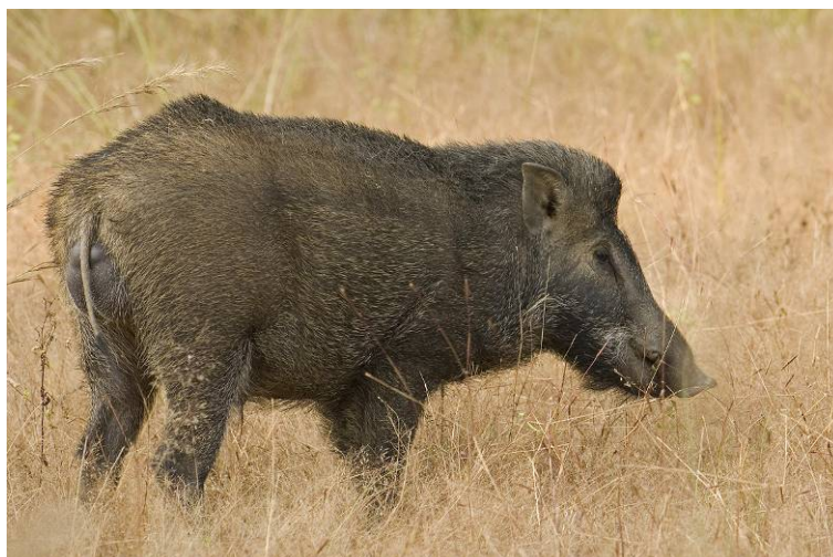
Indian Wild Boar