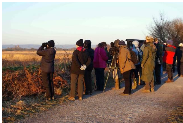
The 2012 Naturetrek Group