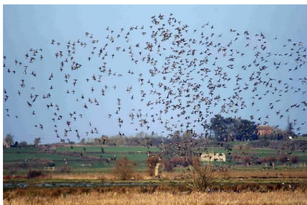
Wigeon take flight