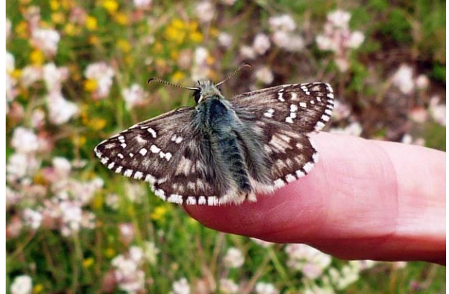
Oberthur's Grizzled Skipper