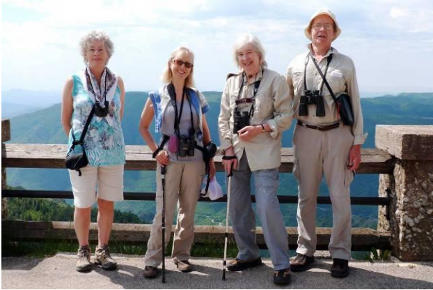
2012 Naturetrek Cevennes Butterfly Group