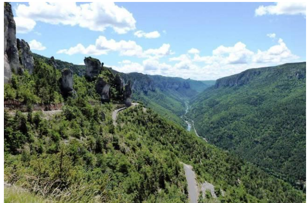
Tarn Gorge near les Vignes