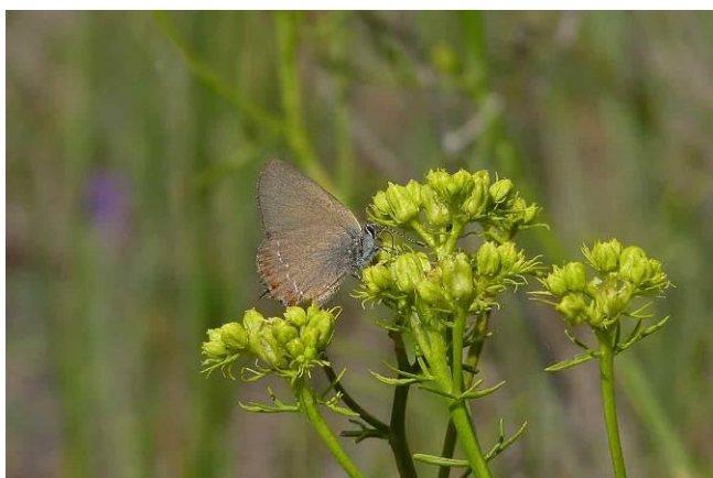
False Ilex Hairstreak