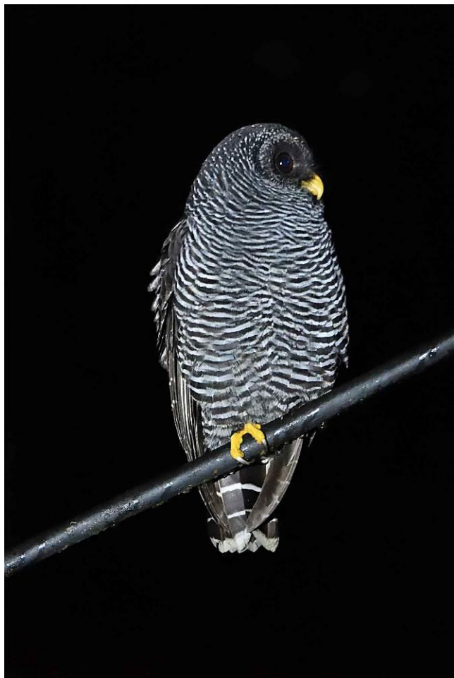
San Isidro Black-Banded Owl