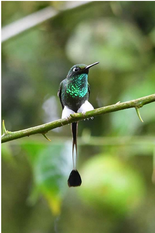
Booted Racket Tail