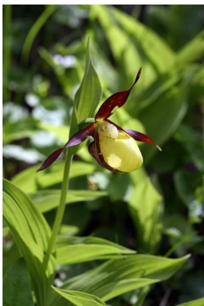
Lady's Slipper Orchid - Cypripedium calceolus