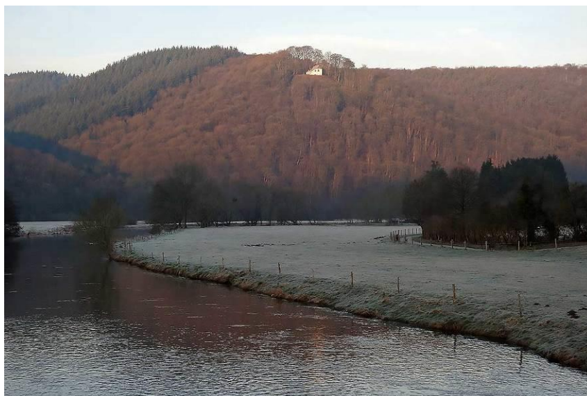
River Ourthe in the morning