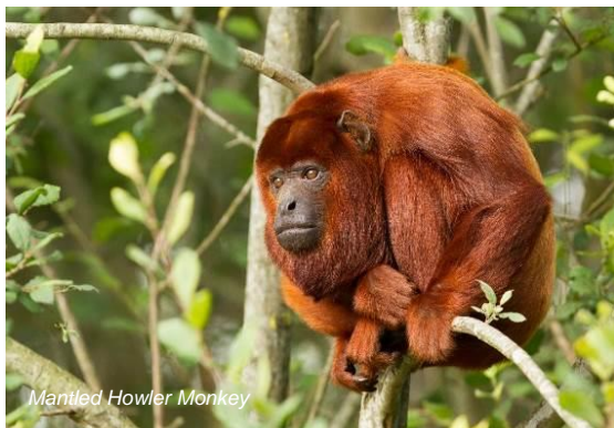
Mantled Howler Monkey

Avocet, Pectoral Sandpiper, Wilson's Phalarope, Franklin's Gull, Elegant Tern, Inca Dove, Mangrove Cuckoo, Lesser Ground-cuckoo, Spectacled Owl, Common Nighthawk, Common Pauraque, Green-breasted Mango, Mangrove Hummingbird, Steely-vented Hummingbird, Plain-capped Starthroat, Black-headed Trogon, Ringed Kingfisher, Turquoise-browed Motmot, Rose-throated Becard, Black-crowned Tityra, Long-tailed Manakin, Scissor-tailed Flycatcher, White-throated Magpie-jay, Wood Thrush, Philadelphia Vireo, Yellow-green Vireo, Ovenbird, Northern Waterthrush,