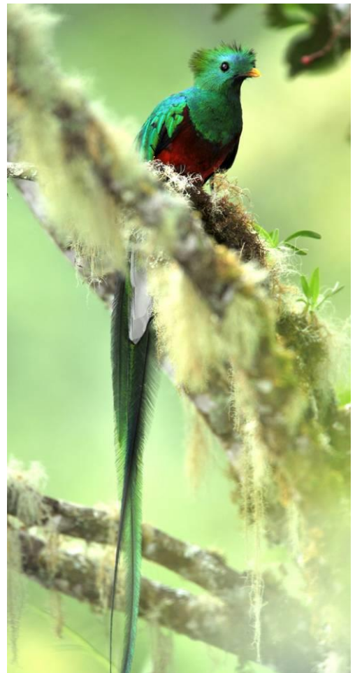
Keel-billed Toucan & Resplendent Quetzal.