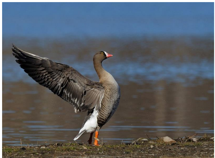
Lesser White-fronted Goose (Stefan Oscarsson)

Our first stop will be at Hjälstaviken, a reed-fringed wetland home to large numbers of birds. Here we will look for Europe's rarest goose, the delicate Lesser White-fronted Goose. This species has suffered badly at the hands of mankind having been almost hunted