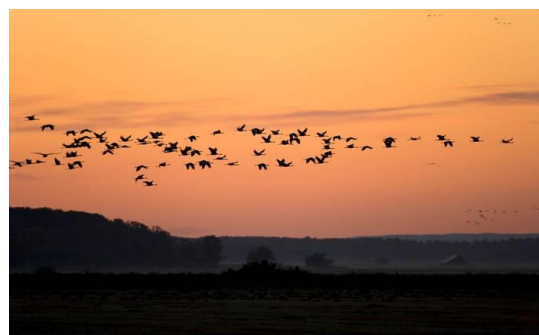
From top: Bluethroat, Pygmy Owl, Cranes at sunset.