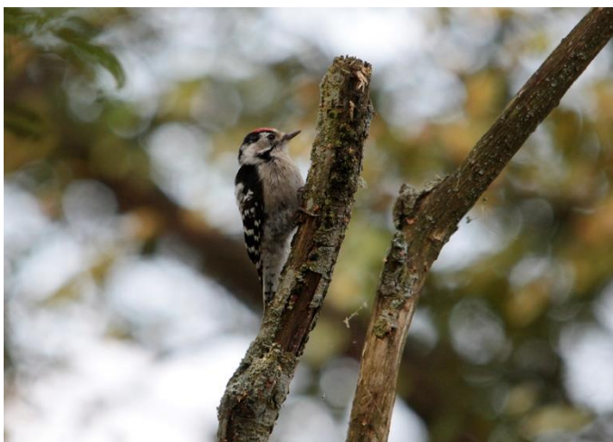
Lesser-spotted Woodpecker (Daniel Green)

On the western edge of the Black River Valley, lies the vast pineforest of Hälleskogen, the southern edge of the great Taiga Forests that extend north and east into Russia and beyond. Dotted with tranquil lakes and extensive bogs and mires, this is a fascinating area to explore and home to a much sought after variety of boreal species. Here we look for the huge Capercaillie and its smaller cousin the Black Grouse, the females in particular are often seen along the roadsides in the early morning and evening taking grit. The elusive Hazel Grouse also live in these dense forests. They are notoriously difficult to see, however, and best located by their piercing high pitched whistle! Easier to spot are the Northern Bullfinch, Willow