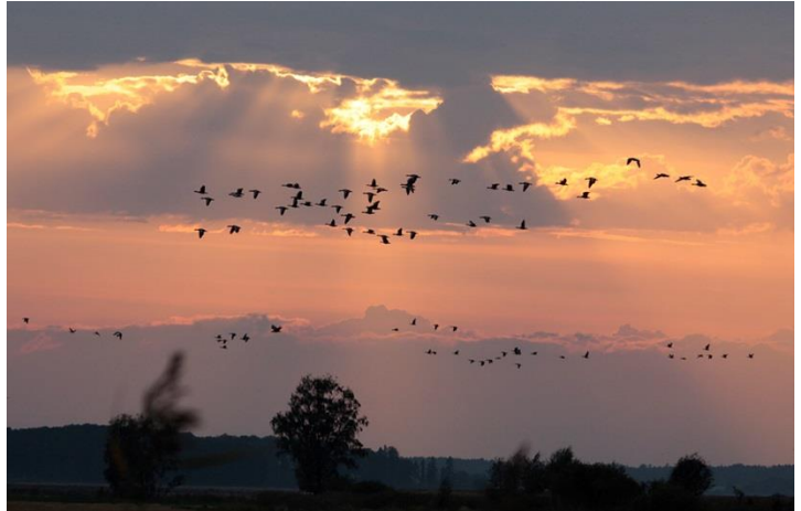
Geese at sunset (Daniel Green)

The highlight of our time in Svartådalen, however, will be the evening at Lake Fläcksjön where hundreds of Common Cranes gather to roost each evening. The sight and sound of these spectacular birds flying overhead backed